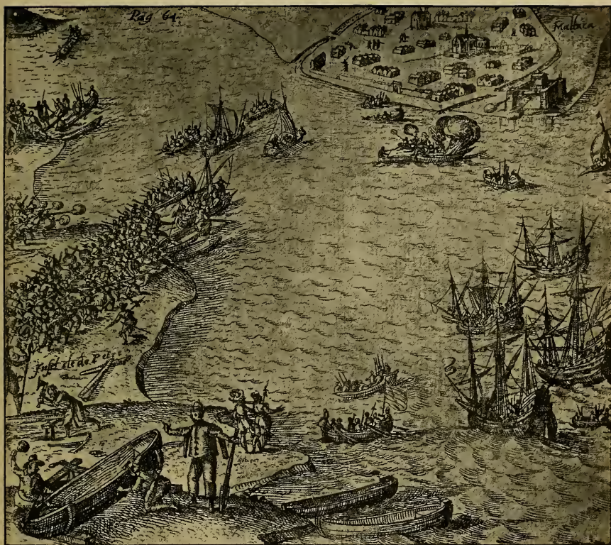
View of Mallaca – Levinus Hulsius (Franckfurt am Mayn, 1612)